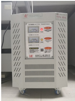
Dry Type Transformer

OSG Three-phase and ODG Single-phase Auto-transformer. Can work for 24h without interruption.